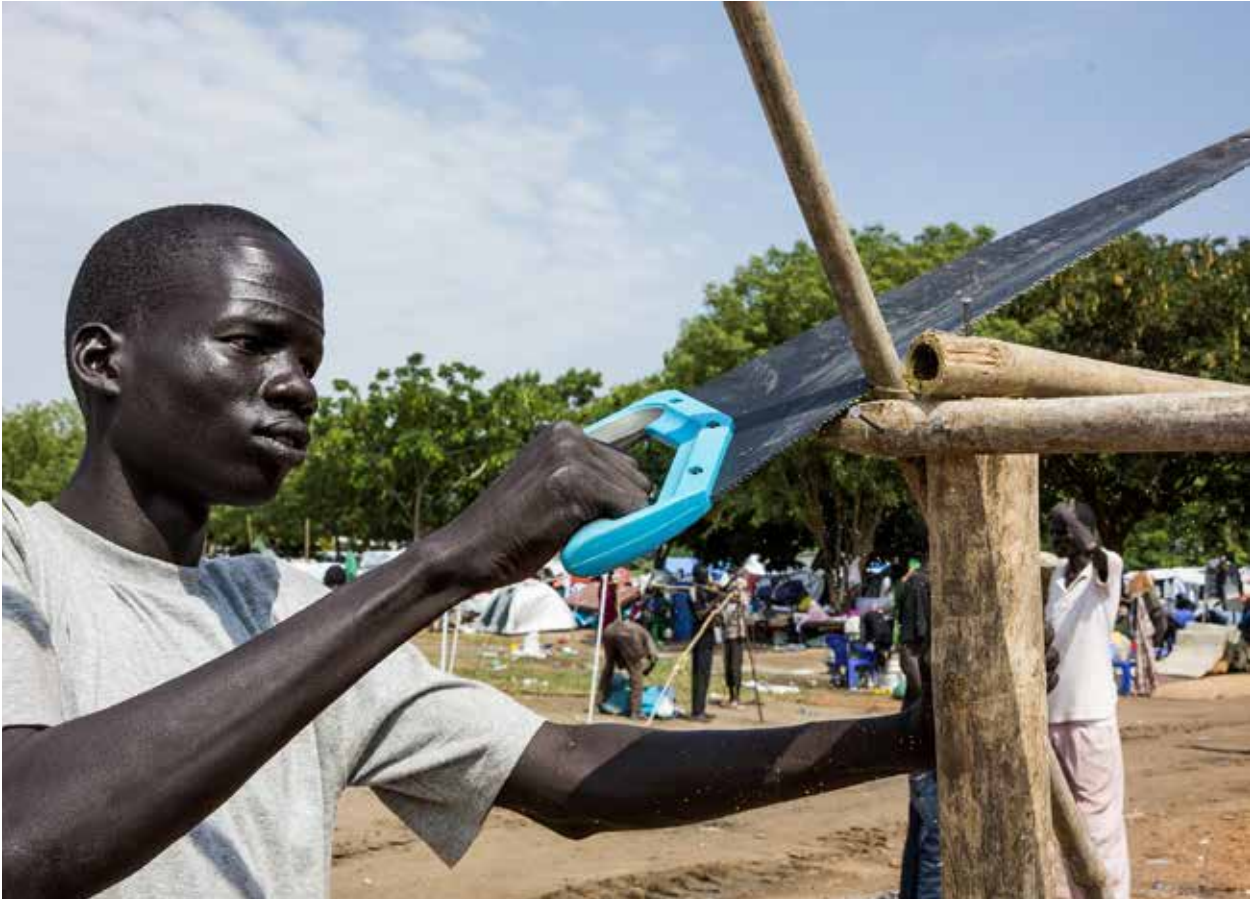
A displaced youth residing at the UNMISS PoC Site in Juba helps erect a temporary shelter.