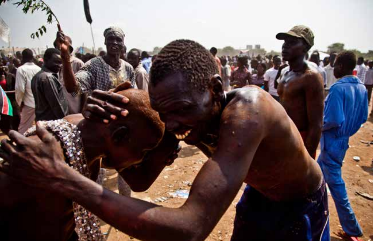
Young South Sudanese men wrestle. Wrestling is one of the sports admired by rural communities in South Sudan.