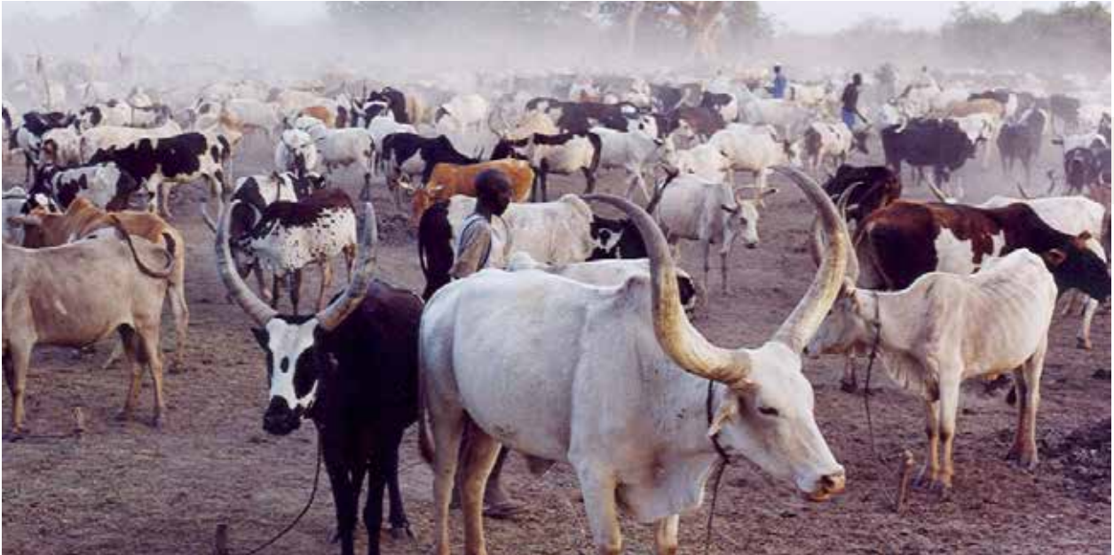
A Dinka cattle camp in Bahr el Ghazal.

done by migrant labour from other countries in East Africa (Ugandans, Kenyans, Ethiopians). It is not clear from youth participants in this study if this is due to lack of knowledge and skills, or a negative attitude among South Sudan youth towards low paid jobs. The former should be addressed through training and positive discrimination, if there is political will to address the issue. If low pay is the problem then it is difficult, though not impossible, for the Government to implement and enforce wage polices. Sudanese youth who have been to school or college are reluctant to take jobs they consider menial. See Box 5.