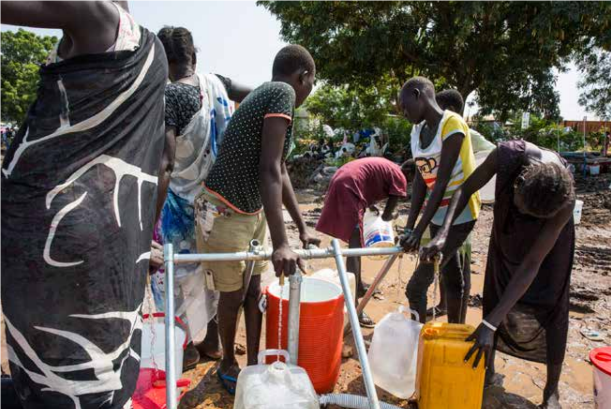
Youth erect shelters to be used as temporary housing for other displaced people at a UNMISS PoC Site in Juba.