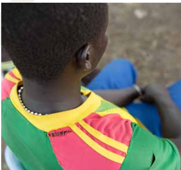
Youth call for capacity building in peacebuilding and conflict resolution: “Without proper training in peacebuilding, youth may contribute negatively rather than helping the situation”.

The youth also highlight some successful peace dialogues, but it should be noted that their contributions were in implementation and not decision making. From a five-day conference to resolve a conflict in Eastern Equatoria: “One of the main actions is to compensate a victim’s family for their loss: 25 cows, and 120 goats were collected for one soul lost. After the