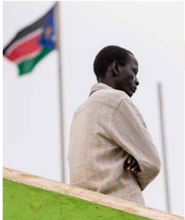
A young men at the Juba Basketball stadium. Sports and cultural activities provide opportunities for young people to meet and build trusting relationships.

challenges and confusion caused by the creation of additional states.